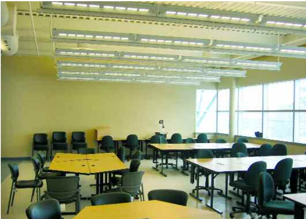
Exposed steel deck and beams at Nova Scotia Community College Pictou Campus. Design by Fowler Bauld & Mitchell Architects.